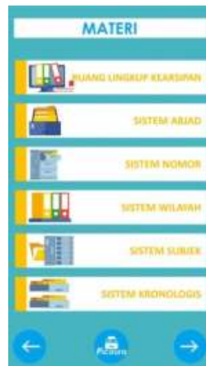
Figure 4. Display list of material in Ficoura