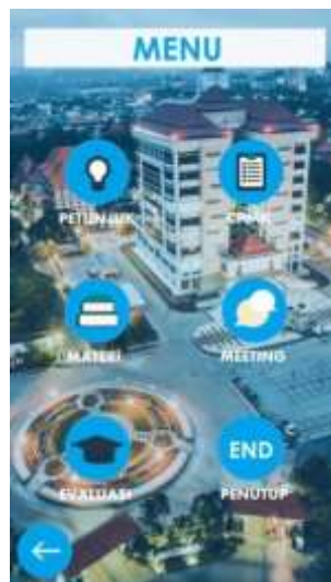
Figure 3. Ficoura menu page