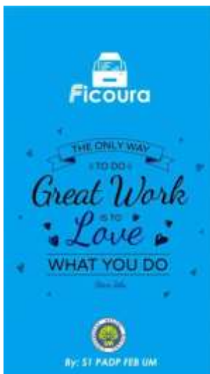
Figure 2. Display of the Ficoura start page

The following are some screenshots of the Ficoura application.