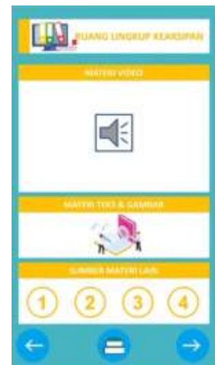
Figure 5. Display material consisting of text and image material, videos, and link resource material on the website

Students can install the Ficoura app on their Android smartphone. Then they can see the video of the introduction of this application to get an overview of the concept of the application. Furthermore, they can learn the Course Learning Outcomes of the 'Filing' Course in the Ficoura application and then fill in the login profile feature to complete their identity as a user. Ficoura is classified as a type of low-tech application where users can operate this application without having to be connected to high-speed internet. This application can also be operated on all versions of Android with a small RAM of 512 MB. With this specification, students who live in rural areas can use this application smoothly even though the Covid-19 pandemic situation is currently happening.