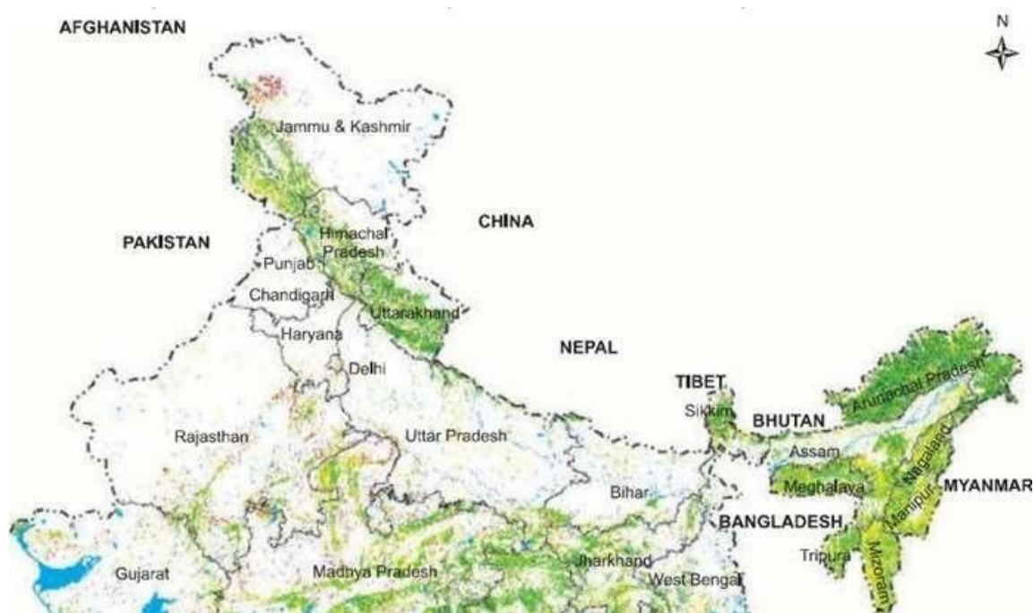
Fig 2. Forest Cover map of Himalayan states of India

In detailed vegetation mapping of Kangan valley of western Himalayas in Pakistan done by Schickh off (1995) it was reported that there was a 50 percent decrease in the forest cover due to change in land utilization practices in this area. In Bashno Valley of western