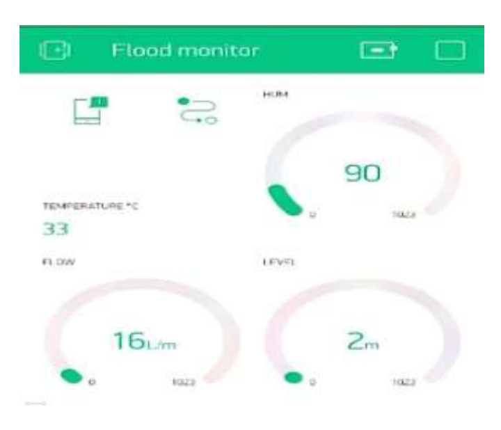
Fig.2.Blynk Application Results

Blynk app free application is installed to the system for monitoring purpose. This is the output obtained from Blynk app showing (i) temperature, (ii) water level (iii) rate of water flow