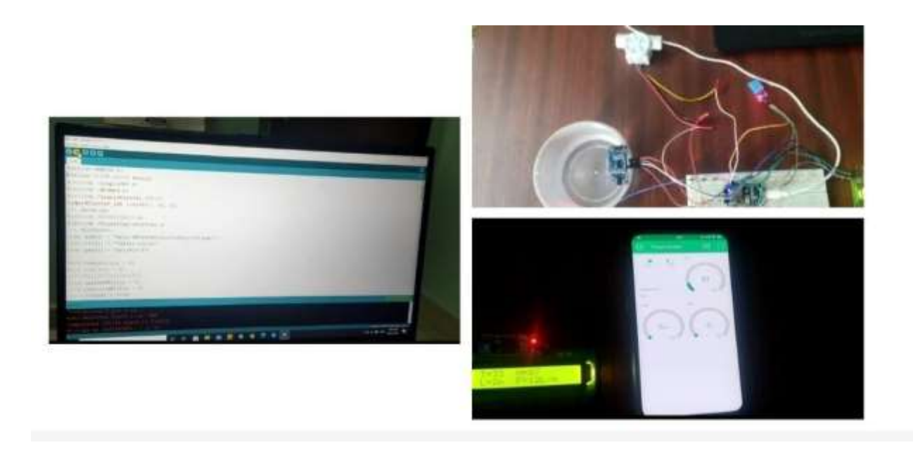
Fig .4. Hardware implementation