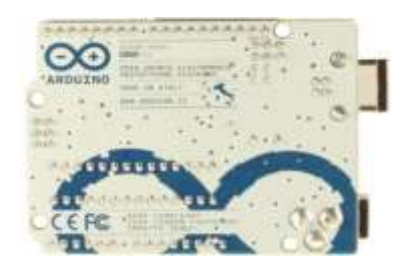
fig 1: Arduino-Uno Model Back View

The Arduino Uno is an opensourcemicrocontroller board based on the Microchip ATmega328P microcontroller and developed by Arduino. The board is equipped with sets of digital and analog input/output pins that may be interfaced to various expansion boards and other circuits