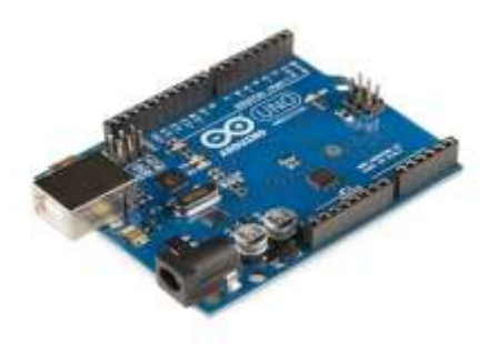
fig 2: Arduino Uno-Model Front View