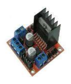
fig 4: DC motor Driver