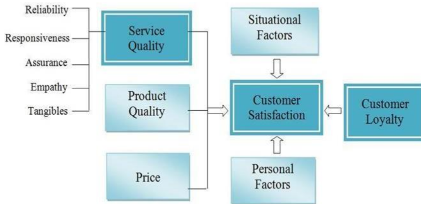
Figure: Service Quality and satisfaction