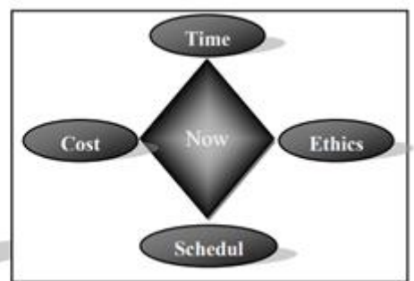
Figure 1: Project Iron Triangle for optimum quality management (Mishra and Mittal, 2011).