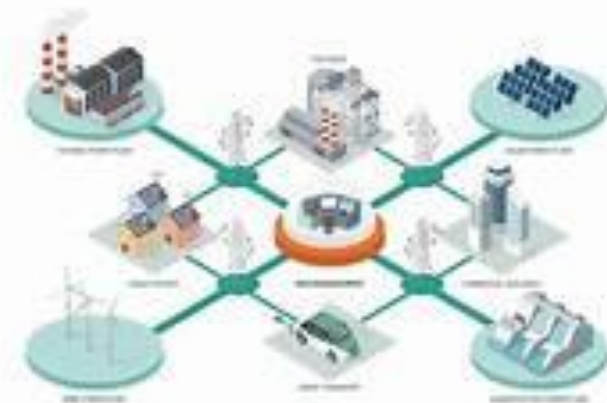
Fig 2. Overview of a Smart Grid

In this section, we delve into the heart of our discussion, exploring how smart building technologies seamlessly merge with the foundational principles of energy efficiency in green structures. We examine the ways in which smart technologies contribute to optimizing energy consumption, enhancing occupant comfort, and ensuring sustainable building operations.