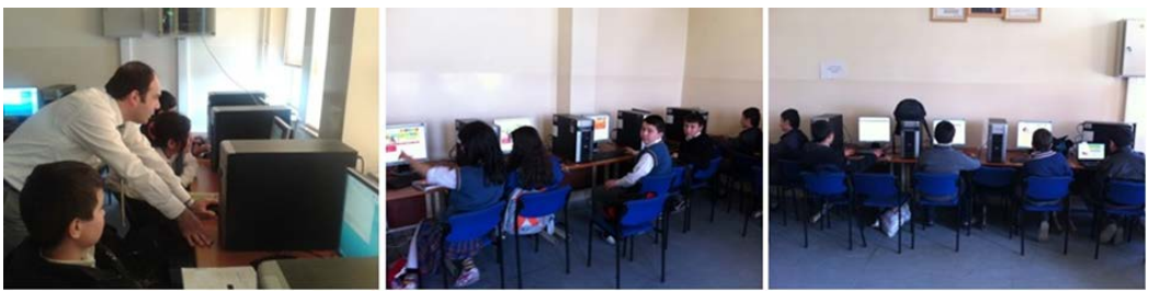
FIGURE 1. A view from the moment of the lesson

This research has a single group semi-experimental pattern model. The research was carried out without any changes in the students' branches, numbers and profiles. As seen in Figure 1, the training carried out by the researcher lasted 12 weeks in total in the computer laboratory of the school in the second term of 2012-2013 academic year, as 2 hours in addition to the daily lesson hours.