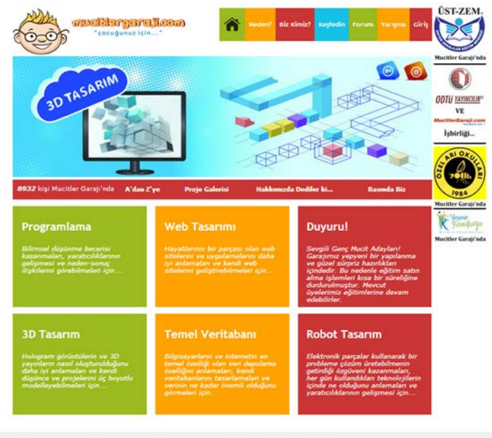
Neden? Biz Kimiz Keşfedin Forum Basında Biz Yanşma Gizillik ve Gövenlik Politikası İletişim mucidergarajı.com © 2012