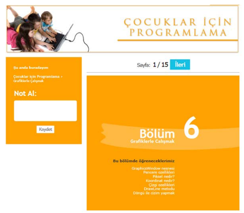
FIGURE 3. An example course page from mucitlergaraji.com

Each topic was explained on a weekly basis, supported by examples. The input screen of an example subject is in Figure 3. The students tried to do the problems found at the end of the subject in the classroom.